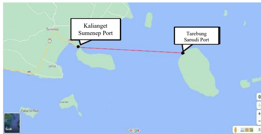
Figure 2. Route of KMP Dharma Bahari Sumekar III