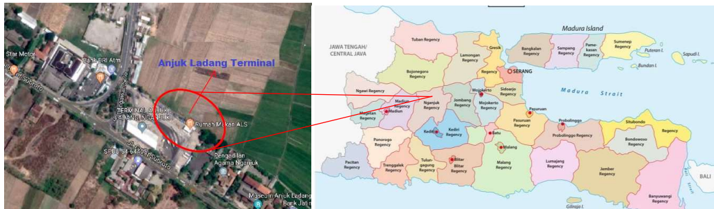
Figure 2. Study Location

The location of this study is Anjuk Ladang terminal in Ringinanom Village, Nganjuk District.