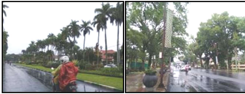
Figure 4. Paths of Malang City, East Java

3. The same lane as the lane on the veteran road. Is a lane on the corridor of the Ijen main road. It has the same road width on the veteran road corridor. However, this lane is relatively less congested, compared to the veteran road corridor area, because the location of this line is outside the office area, trade and so on. However, it is more in the residential area of the community and above, and there tends to be no activity in the corridor of the Ijen Big road.