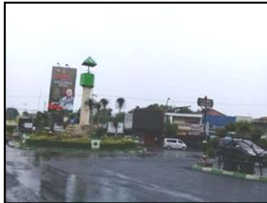
Figure 9. Nodes of Malang City, East Java

3. The next Malang city node is on Basuki Rahmat street, this is a dense city node in the afternoon, because this is a city node with dense activities from the city market to the city psat, and also a city node that does not have existing traffic signs, so this area is often the center of density of the city area.