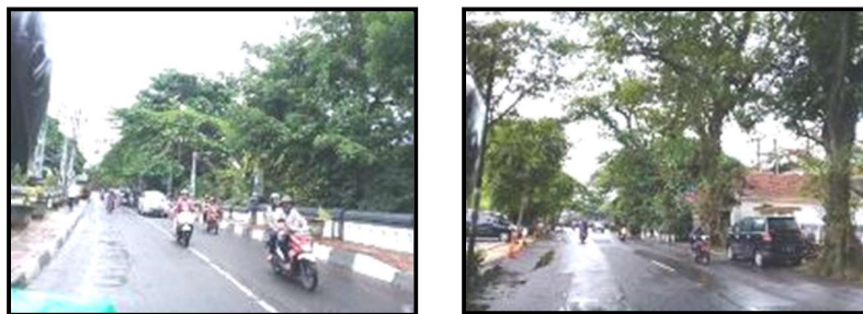
Figure 5. Paths of Malang City, East Java

3. The same lane as the lane on the veteran road. Is a lane on the corridor of the Ijen main road. It has the same road width on the veteran road corridor. However, this lane is relatively less congested, compared to the veteran road corridor area, because the location of this line is outside the office area, trade and so on. However, it is more in the residential area of the community and above, and there tends to be no activity in the corridor of the Ijen Big road.