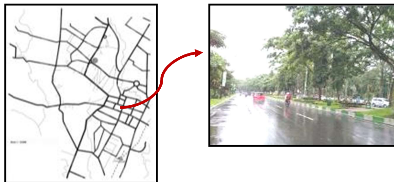
Figure 3. Paths of Malang City, East Java

1. The path from Malang city is in the middle part of the rigid pattern, but in its development these paths become diverse, and develop according to the pattern formed in the existing development pattern of the Malang city community. This rigid pattern was formed by the Dutch colonial era government. As shown in the picture below, are paths formed from antiquity to the present. According to Patricia (2014)[8] the historical elements of the city of Malang that were mapped by paths area experts were Jalan Kayutangan to Pasar Besar, kertanegara road to semeru road, ijen road, oro-oro dowo road, Kawi road.