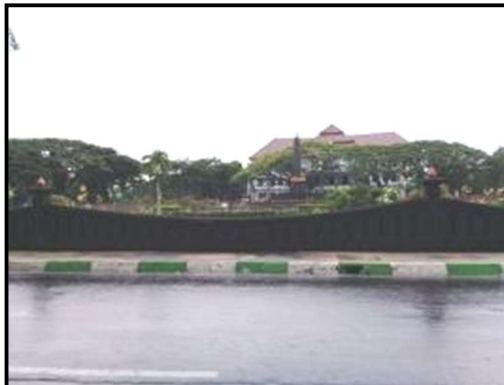
Figure 11. Landmarks of Malang City, East Java

1. Malang city is a city formed by the Dutch colonial, this city has several distinctive cirri that can be depicted clearly without having to explain details about history, and so on, namely landmarks in the form of Boulevard. Boulevard is a flower, which was given to the region due to its high historical value, and became the center of Dutch colonial settlements. So this Boulevard flower monument monument was built in the middle of a wide road in the corridor area of Ijen Besar street, so that people who see it will immediately know that it is a big flower Boulevard, and it characterizes the city of Malang now.