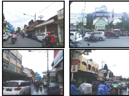
Figure 13. District of Malang City, East Java (Sources: Documentation of Researcher, 2022)

2. The next region that characterizes the city is the market. However, this market is commonly given the nickname big market, so this market becomes distinctive and becomes unique to be known, in addition to the vertical shape of the building period order, although this market is traditional, this market is the largest market center in the city of Malang, from the regency area of trading, shopping, and trade transactions are in this large market area. The characteristic of the big market is the developed shophouse order, the existing parking area, being people able to understand, that this is a corridor and a large market area of Malang city.