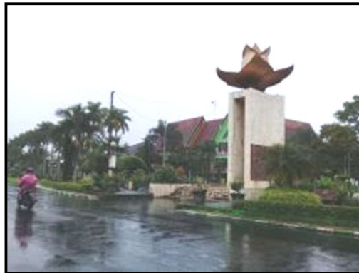
Figure 10. Landmarks of Malang City, East Java

1. Malang city is a city formed by the Dutch colonial, this city has several distinctive cirri that can be depicted clearly without having to explain details about history, and so on, namely landmarks in the form of Boulevard. Boulevard is a flower, which was given to the region due to its high historical value, and became the center of Dutch colonial settlements. So this Boulevard flower monument monument was built in the middle of a wide road in the corridor area of Ijen Besar street, so that people who see it will immediately know that it is a big flower Boulevard, and it characterizes the city of Malang now.