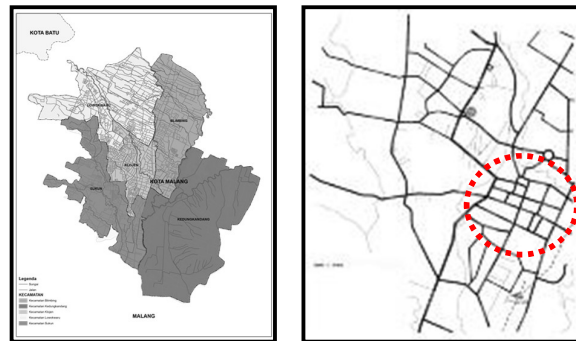
Figure 2. Paths of Malang City, East Java

1. The path from Malang city is in the middle part of the rigid pattern, but in its development these paths become diverse, and develop according to the pattern formed in the existing development pattern of the Malang city community. This rigid pattern was formed by the Dutch colonial era government. As shown in the picture below, are paths formed from antiquity to the present. According to Patricia (2014)[8] the historical elements of the city of Malang that were mapped by paths area experts were Jalan Kayutangan to Pasar Besar, kertanegara road to semeru road, ijen road, oro-oro dowo road, Kawi road.