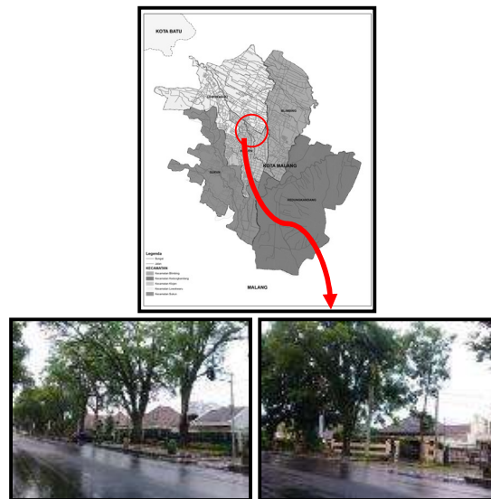
Figure 12. District of Malang City, East Java

The development of the region in Malang City is indeed very fast and significant. In the past, the main projections and districts that became characteristic were the mountain road area, the island road area, and Chinatown[8]. As population growth and transmigration increase rapidly, the district element has become a distinct attraction.