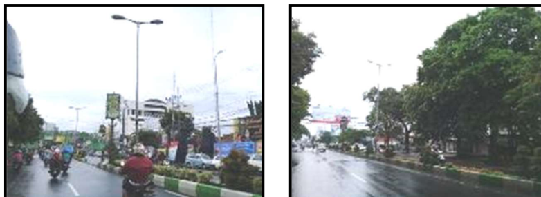
Figure 6. Paths of Malang City, East Java

4. The next road corridor is the corridor that connects Kahuripan road to Malang City Hall square. This access makes the main access for the general public in the Malang city area who will go to the Malang city station and towards the southern part of the city of Malang.