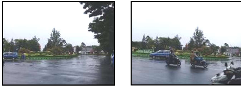
Figure 8. Nodes of Malang City, East Java

2. The next city node is at the roundabout and the meeting area between the lines from outside the city of Malang, and the city of Malang, its location at this node continues to be crowded with vehicles, because the center of the meeting of the city of Malang and outside the city of Malang.