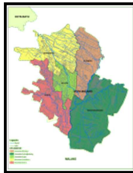
Figure 1. Maps of Malang City (Sources: Google.co.id, accessed on 2022, May 01, 2022)

Malang City has an area of about 145.3 km 2 with an area altitude of 476 meters above sea level. So that this height makes the city of Malang have a cool temperature. Malang City consists of 5 sub-districts, namely Sukun, Klojen, Kedungkandang, Lowokwaru, and Blimbing. The population is about 895,387 inhabitants, and it can be concluded that the population density is 6,200/km 2 . So that the population in the city of Malang is so dense. This density is the benchmark in analyzing the development of urban elements.